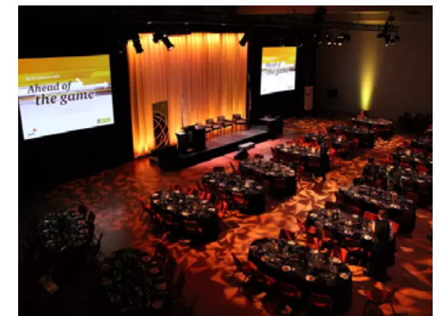
Shed 6 Conference in action