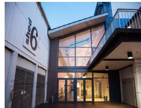
Shed 6 Entrance