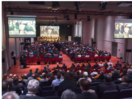
Shed 6 seating setup similar to Saturday/Sunday